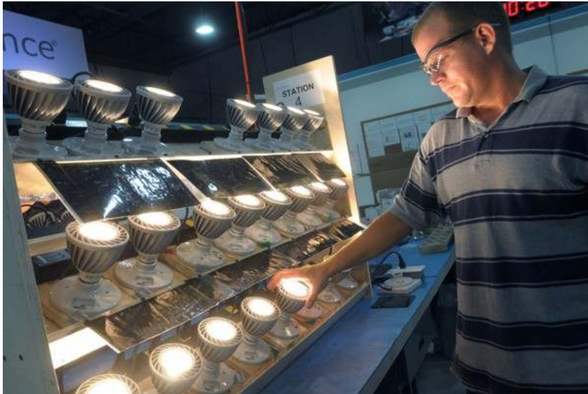
View Photo Gallery — A look inside the Florida factory of LED bulb manufacturer Lighting Science Group, the sort of innovative, "green" company that many would like to keep in the U.S.