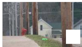
Wis. Town's Mysterious Booms