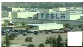
Obama's Green Car Program Under Scrutiny Watch Video

Chu said he wasn't aware of many of the alleged connections but said department guidelines would have prevented any of the individuals from participating in discussions that would have influenced the loan process. Further, Chu says the decision would have come from career agency employees, not political appointees who could be influenced by their party.