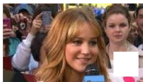
'The Hunger Games' Star Reveals Tough Film Prep