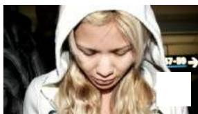
Swimsuit Model's Alleged Drug Ring