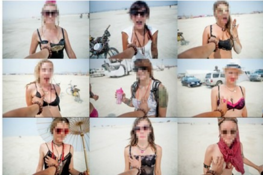
(PHOTO: The women at Burning Man allow strangers to simply walk up to them and grab their boobs)

“We’re not going to set up a Marxist state,” he said. “We see culture as a self-organising thing. And we’re unwilling to impose and mandate behavior from the outside, we want to generate change from the inside.”